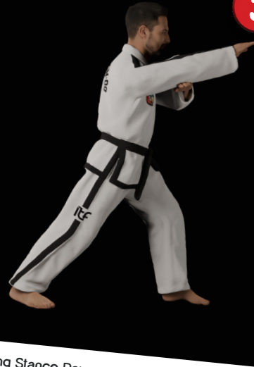
Walking Stance Reverse Knife-hand High Strike Gunnun So Sonkal Dung Nopunde Ap Taerigi