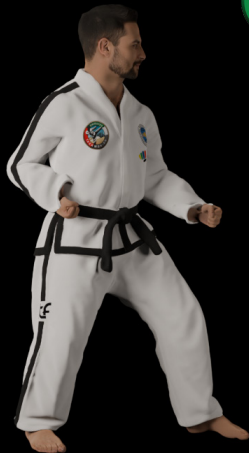
L-Stance Forearm Low Block Niunja So Palmok Najunde Makgi