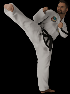
Side Turning Kick Yop Dollyo Chagi