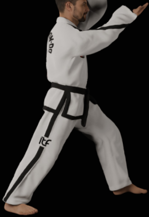
Walking Stance Knife-hand High Front Strike Gunnun So Sonkal Nopunde Ap Taerigi