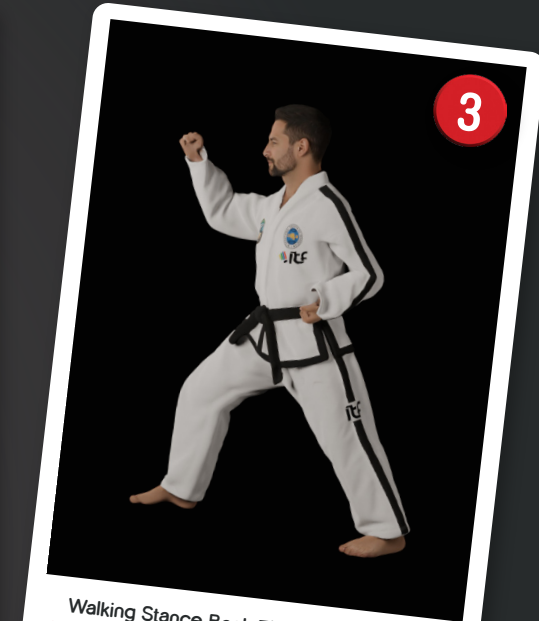
3 Walking Stance Back Fist High Side Strike Gunnun So Dung Joomuk Nopunde Yop Taerigi