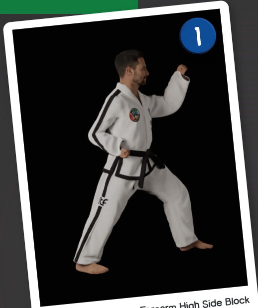
1 Walking Stance Outer Forearm High Side Block Gunnun So Bakat Palmok Nopunde Yop Makgi