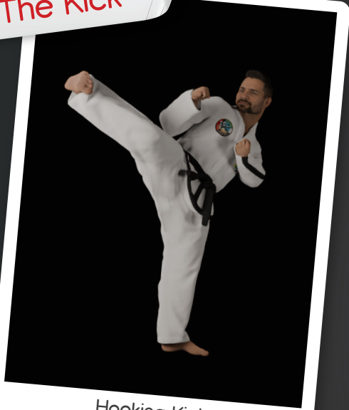
Hooking Kick Goro Chagi