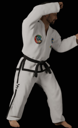
L-stance Twin Forearm Block Niunja So Sang Palmok Makgi