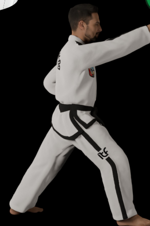
Walking Stance High Punch Gunnun So Nopunde Jirugi