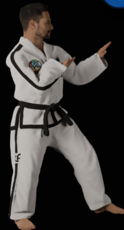
L-stance Knife-hand Guarding Block Niunja So Sonkal Daebi Makgi