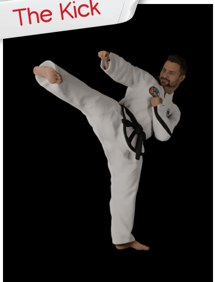
Stepping Side Kick Yop Chagi