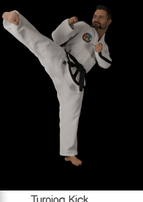
Turning Kick Dollyo Chagi