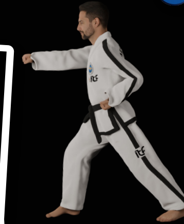
Walking Stance Middle Front Punch Gunnun So Kaunde Ap Jirugi