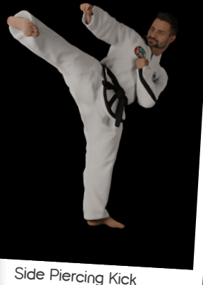
Side Piercing Kick Yopcha Jirugi