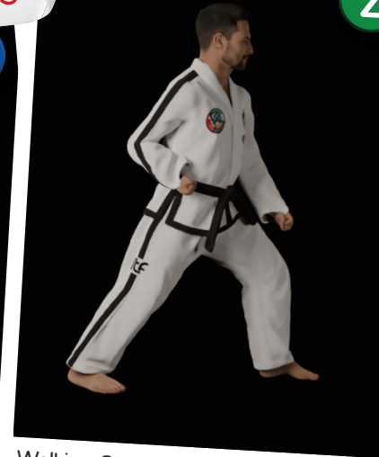
Walking Stance Forearm Low Block Gunnun So Palmok Najunde Makgi