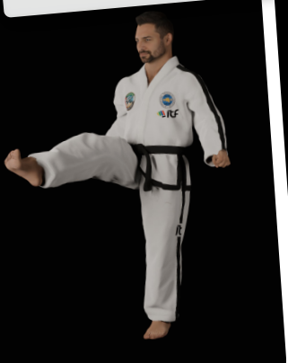
Front Snapping Kick Apcha Busigi