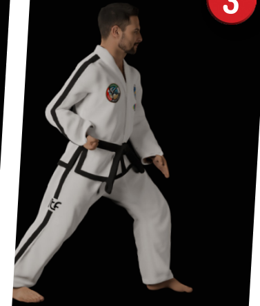
Walking Stance Knife-hand Low Block Gunnun So Sonkal Najunde Makgi