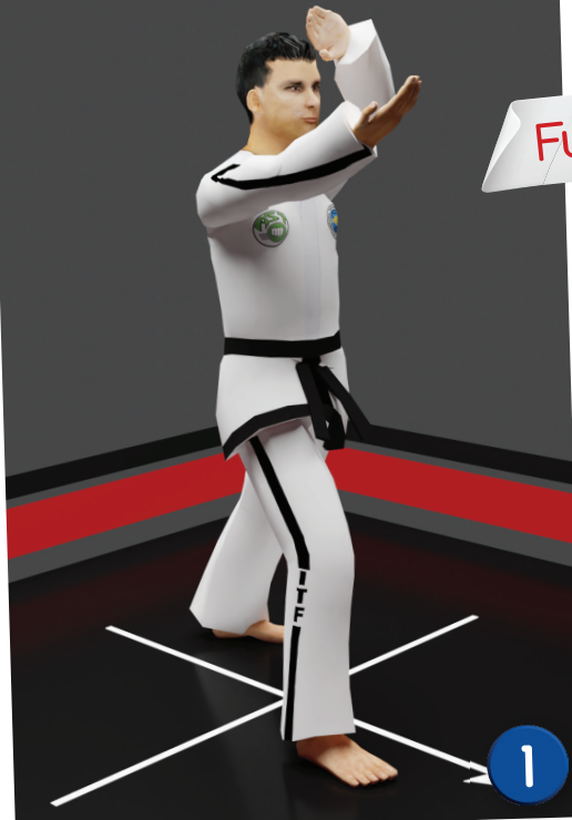
Walking Stance Knife-hand High Front Strike Gunnun So Sonkal Nopunde Ap Taerigi