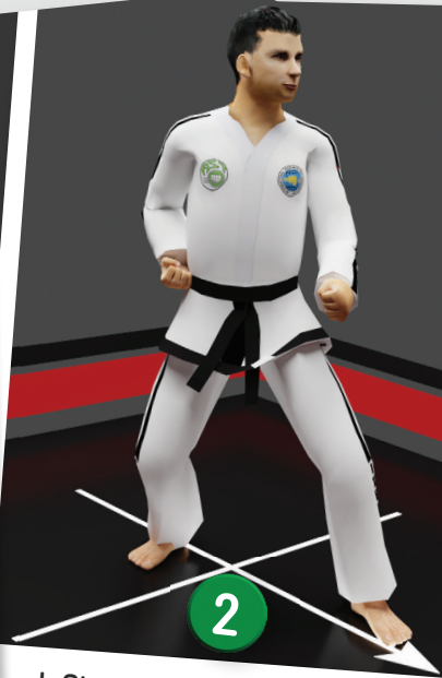
L-Stance Forearm Low Block Niunja So Palmok Najunde Makgi