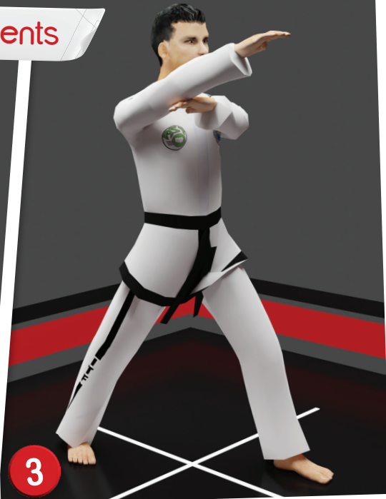
Walking Stance Reverse Knife-hand High Strike Gunnun So Sonkal Dung Nopunde Ap Taerigi