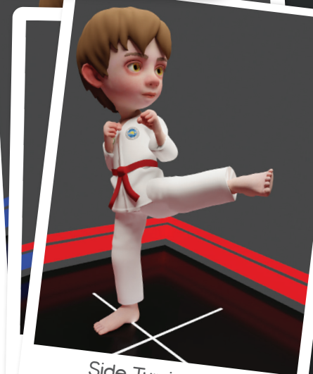
Side Turning Kick Yop Dollyo Chagi