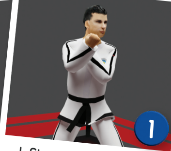
L-Stance Upward Punch Niunja So Ollyo Jirugi