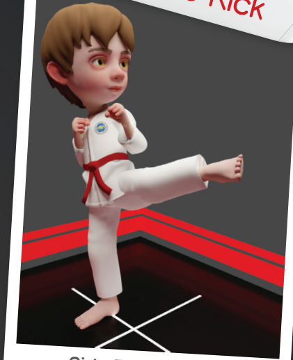
Side Turning Kick Yop Dollyo Chagi