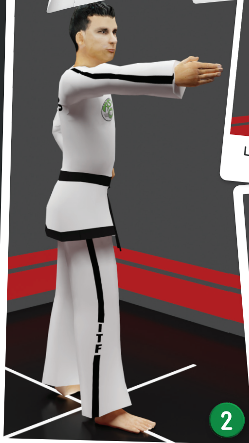
Vertical Stance Knife-hand Downward Strike Soojik So Sonkal Naeryo Taerigi