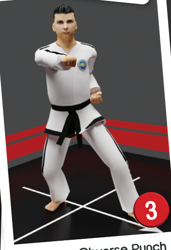
L-Stance Obverse Punch Niunja So Baro Jirugi