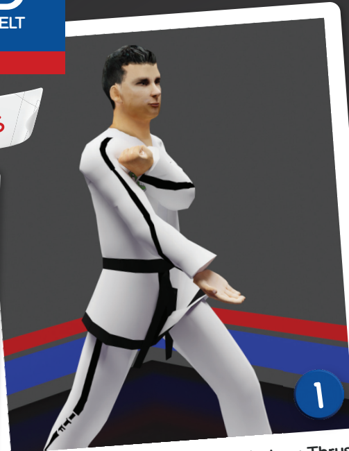
Walking Stance Upset Fingertip Low Thrust Gunnun So Dwijibun Sonkut Najunde Tulgi