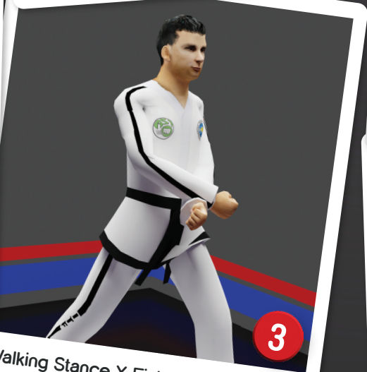
Walking Stance X-Fist Pressing Block Gunnun So Kyocha Joomuk Noollo Makgi