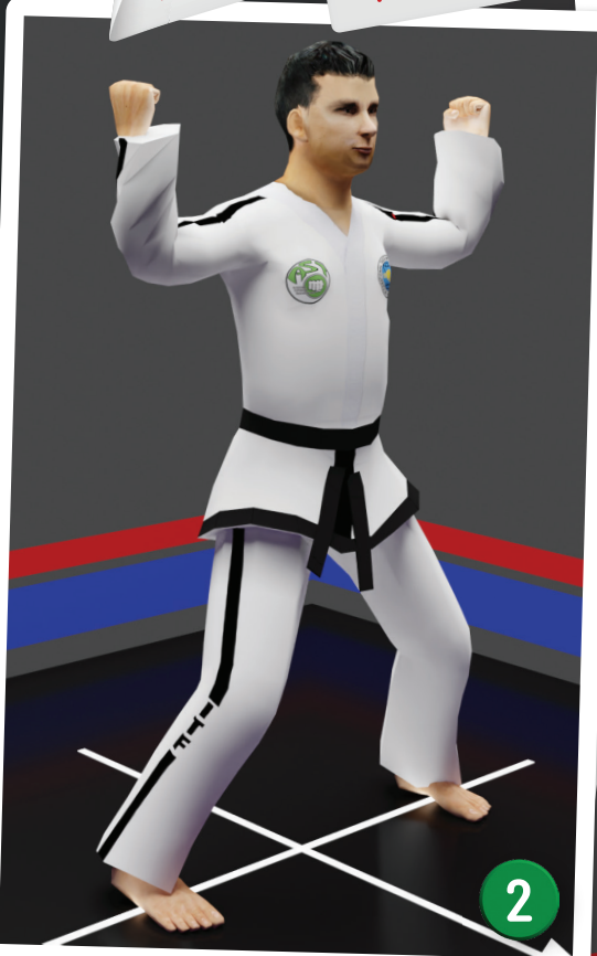
Sitting Stance Outer Forearm W-Shape Block Annun So Bakat Palmok San Makgi