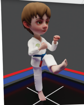
Twisting Kick Bituro Chagi