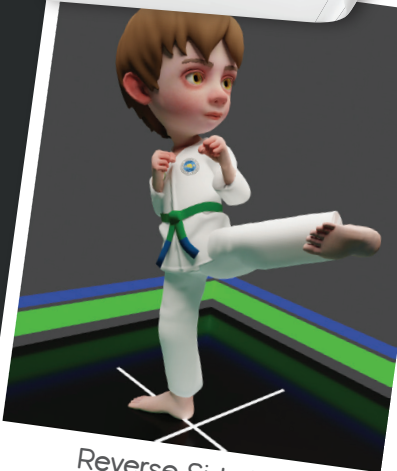
Reverse Side Kick Mondora Yop Chagi