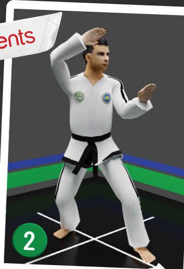
2 L-Stance Twin Knife-hand Block Niunja So Sang Sonkal Makgi