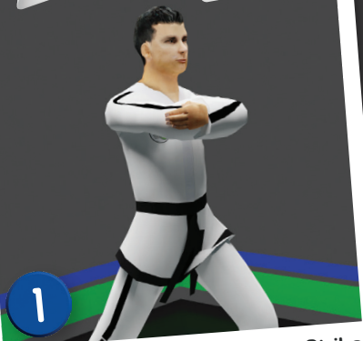
1 Walking Stance Front Elbow Strike Gunnun So Ap Palkup Taerigi