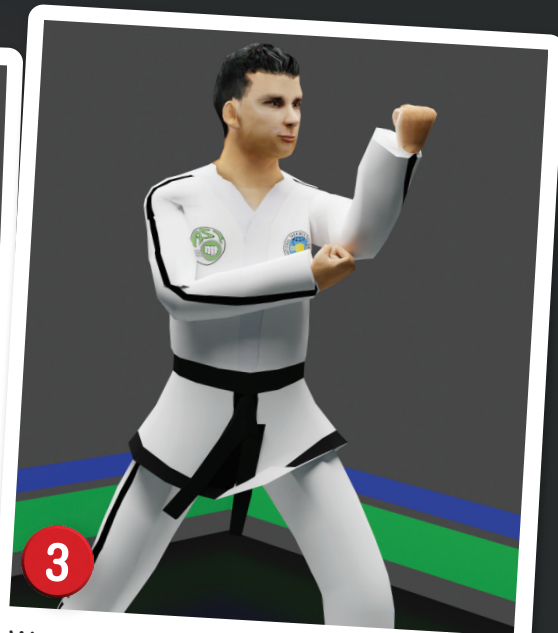
3 Walking Stance Double Forearm High Block Gunnun So Doo Palmok Nopunde Makgi