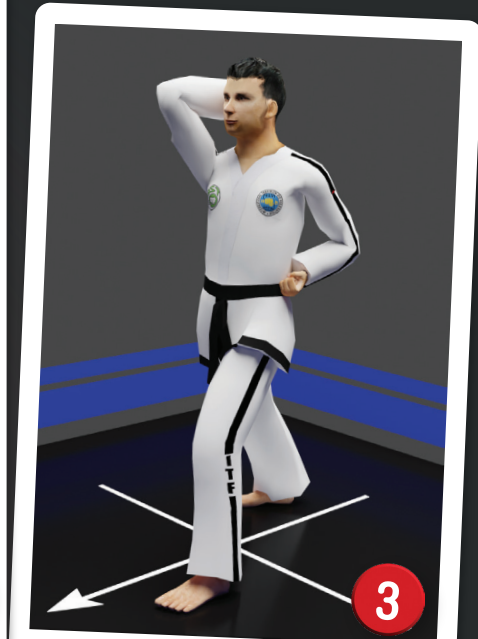
3 Walking Stance Upper Elbow Strike Gunnun So Wipalgup Taerigi