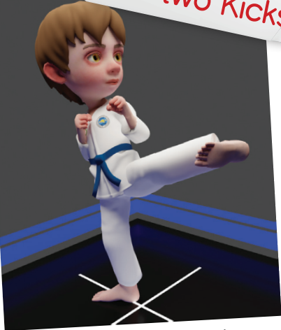
Reverse Turning Kick Bandae Dollyo Chagi + Reverse Hooking Kick Bandae Dollyo Goro Chagi