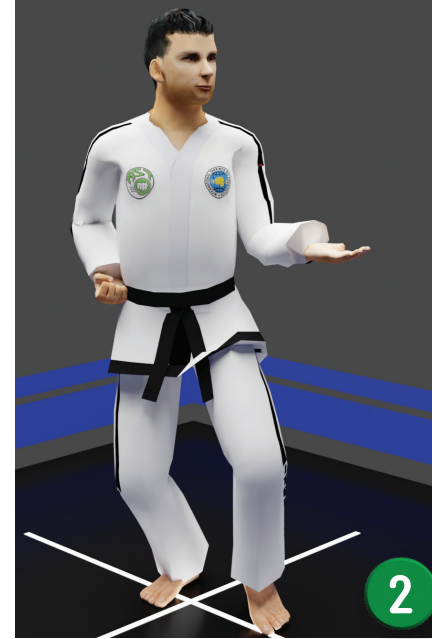
2 Rear Foot Stance Palm Upward Block Dwitbal So Sonbadak Ollyo Makgi