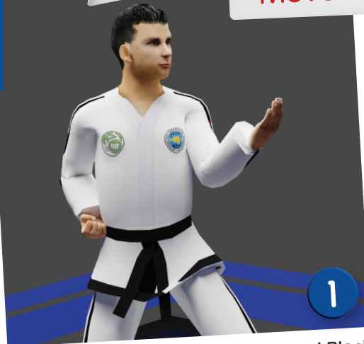
1 L-stance Reverse Knife-hand Outward Block Niunja So Sonkal Dung Bakuro Makgi